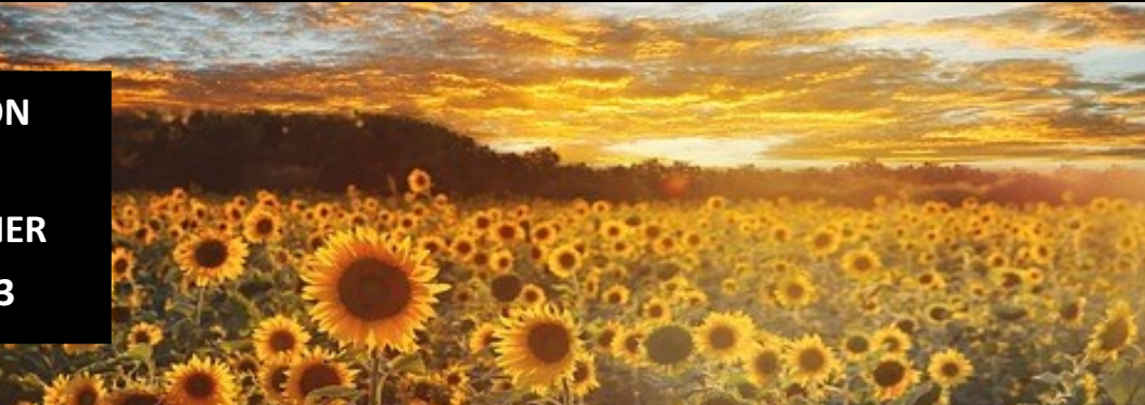
Reading: Judges 17 | Optional Reading: Judges 18 - 21

WEEKLY DEVOTION WITH PASTOR DAVE MINER Devotion No. 103